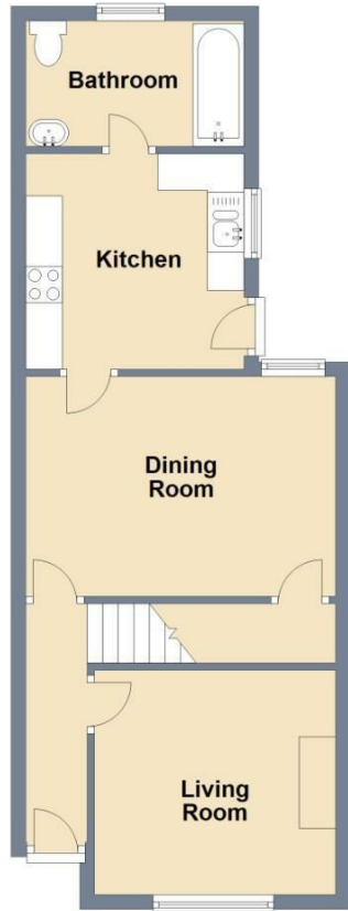
Ground Floor Approx. 43.6 sq. metres (468.9 sq. feet)